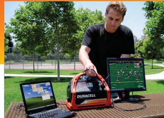
Portable power anywhere